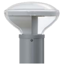
SBL2 WLF Wildlife Friendly