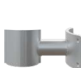
PM Pylon Mounted