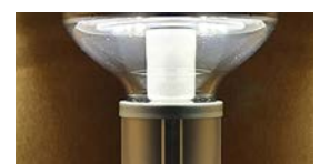
4000K Natural White