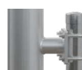
RMR Round Rail Mounted