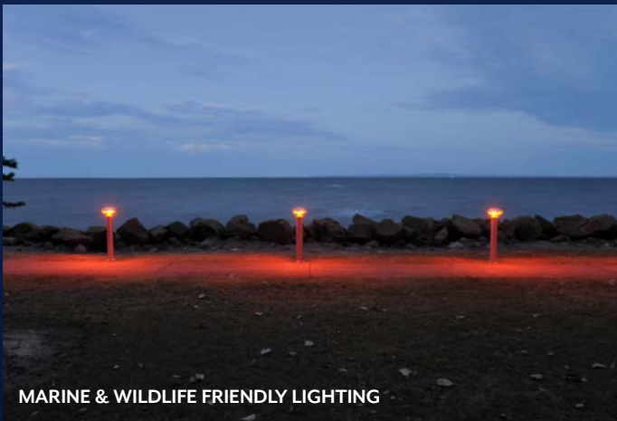
MARINE & WILDLIFE FRIENDLY LIGHTING