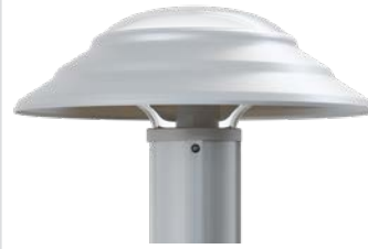
SBL2 SR Full Dark Sky Compliance