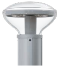
SBL2 S MODEL General Lighting

Light directed downward, for full concentration of light onto the ground surface