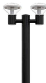
2OH 2 Light Head