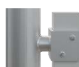
FM Fence Mounted