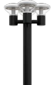
4OH 4 Light Head