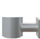
WM Wall Mounted

Simple core hole and concrete fill for maximum security