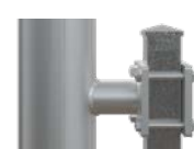
RMS Square Rail Mounted