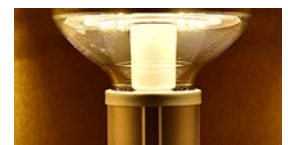
3000K Warm White