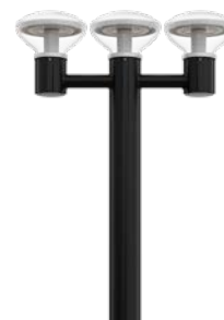
3OH 3 Light Head